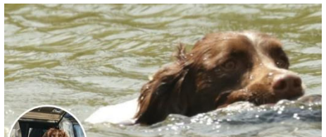
HilandsFlush Working Spaniels