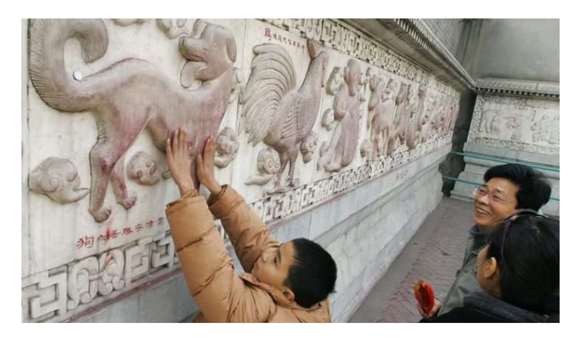
This Chinese child rubs the image of the Dog for luck in 2018

2018 is the Chinese year of the Dog which began on Friday 16<sup>th</sup> February and ends on the 4<sup>th</sup> February 2019. The Dog is the eleventh sign in the 12 year cycle of zodiac animals in the Chinese calendar. Those born under the Dog are defined as independent, sincere, loyal, decisive. who aren't afraid of the difficulties in life. Due to these characteristics they also enjoy harmonious relationship with those around them Chinese astrologers assert that 2018 falls under the element Earth which also brings healing, stability and focus on nutrition.