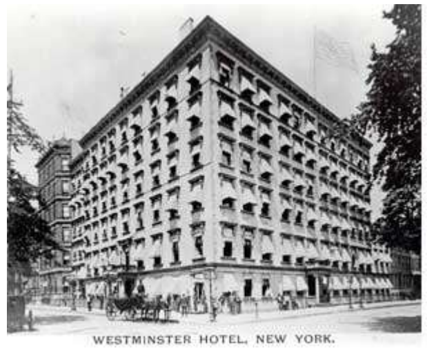
The hotel after which the Club was named

142nd WESTMINTER KENNEL CLUB DOG SHOW New York USA