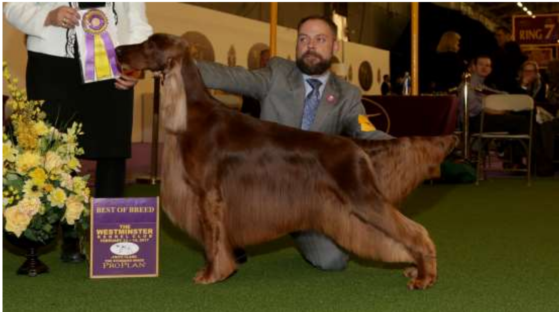
GCH CH Vermilions Sea Breeze (d)