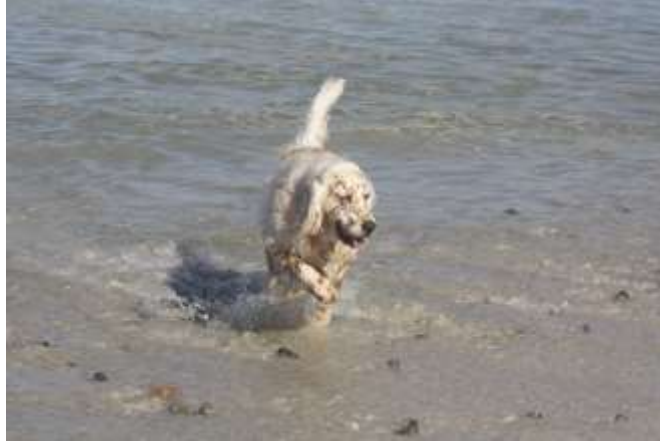
Ch. Whidaura's Whidbey Magic (Imp Australia)