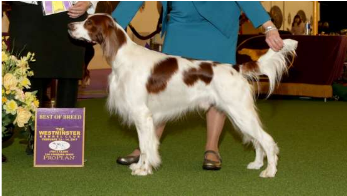
GCH Killary's Grand Getaway(d) Best Opposite Sex Ch Aislingcudo Is Nessa Na Ri (b)